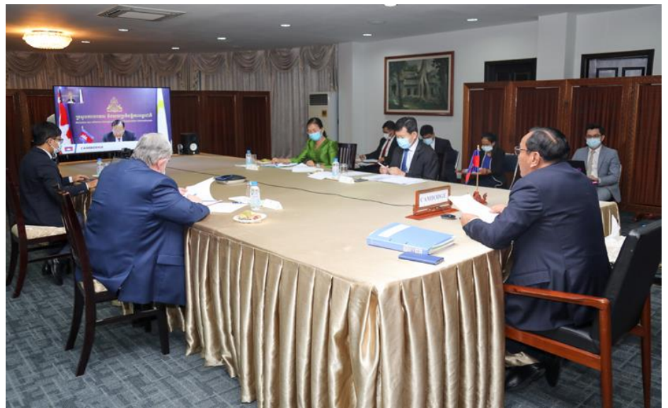
H.E. Prak Sokhonn, Cambodian Deputy Prime Minister, Minister of Foreign Affairs and International Cooperation participated in the 37 th Ministerial Conference of La Francophonie on 24 November 2020.

Ms. Louise Mushikiwabo, Secretary General of the International Organisation of La Francophonie (OIF) has planned to visit Cambodia and its region in 2021 for the implementation of the OIF's economic strategy.