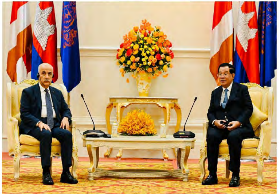
Bilateral Talks Between Prime Minister Hun Sen and H.E. Vahit Kirişçi

The Turkish government expressed her intention to boost Cambodia-Türkiye trade volume to USD 1 billion annually, Turkish agriculture minister Vahit Kirişçi spoke during his courtesy call on Cambodian prime minister Hun Sen on Wednesday (Jan 11) at the Peace Palace.